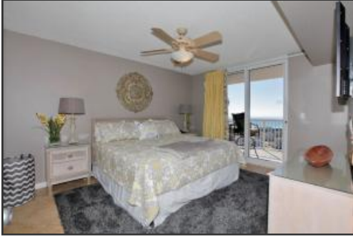
1404masterbed - Copy